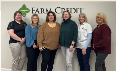
Members of LEAD Maryland with Colonial Farm Credit.