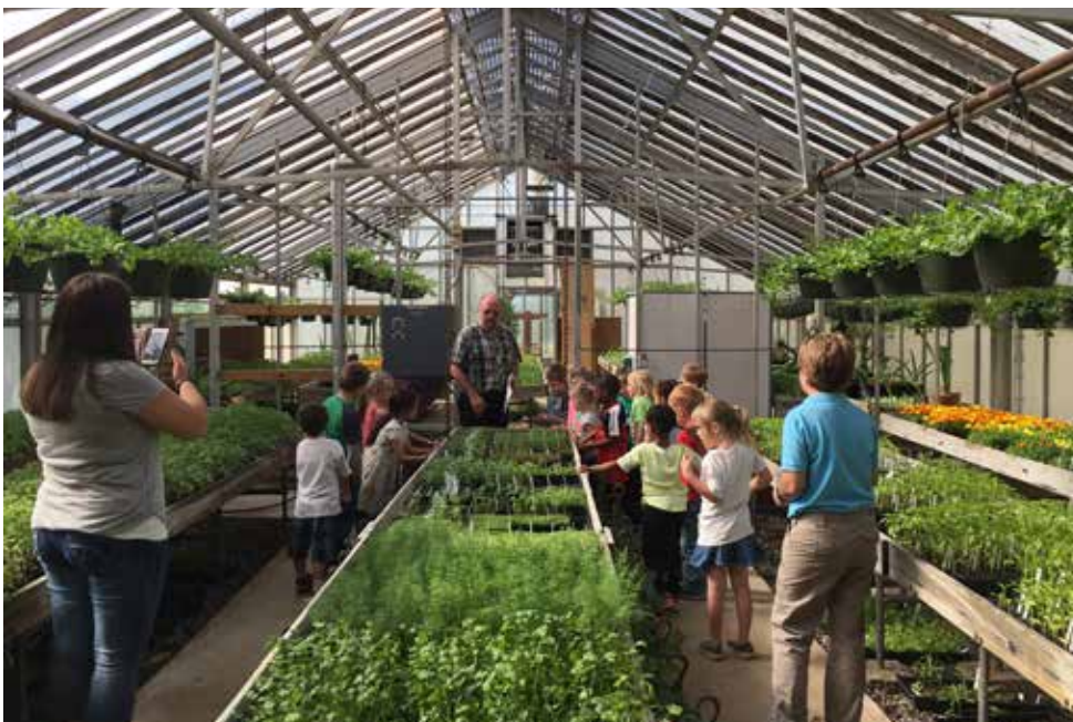
VA Farm Show