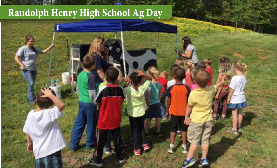
Randolph Henry High School Ag Day