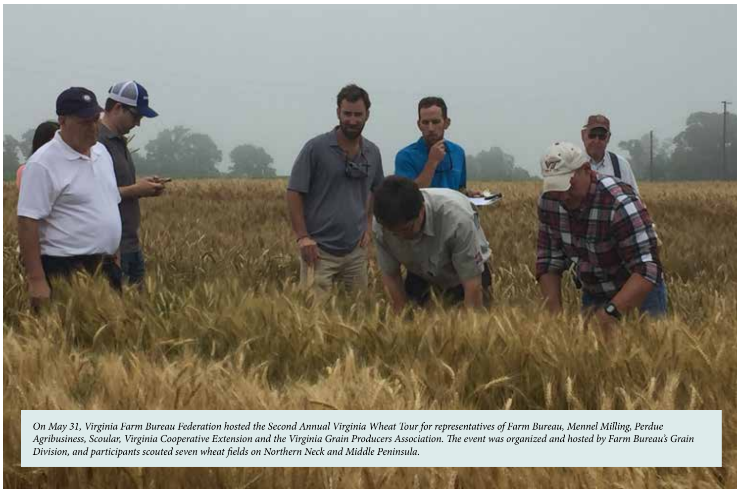
On May 31, Virginia Farm Bureau Federation hosted the Second Annual Virginia Wheat Tour for representatives of Farm Bureau, Mennel Milling, Perdue Agribusiness, Scoular, Virginia Cooperative Extension and the Virginia Grain Producers Association. The event was organized and hosted by Farm Bureau's Grain Division, and participants scouted seven wheat fields on Northern Neck and Middle Peninsula.

Farm Bureau took a major stand for agriculture a few years ago when it purchased the State Fair of Virginia after the previous fair owners declared bankruptcy. Virginia's is the nation's only state Farm Bureau that owns a state fair, and Virginia Farm Bureau is committed to preserving the event's agricultural heritage. ■